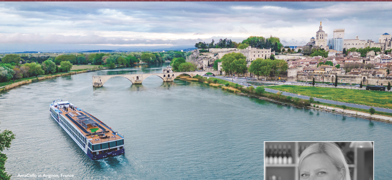
AmaCello in Avignon, France

UNCORK LOCAL TRADITIONS, SAVOR INTENSE FLAVORS AND ENJOY PALATE-PLEASEING ADVENTURES DURING AN AMAWATERWAYS WINE CRUISE