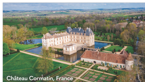
Château Cormatin, France